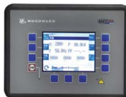
EASY GEN 3500

(5) The generator may be classified as a normal use generator according to the Electricity Enterprises Law depending upon the installation and operation procedure. Consult with a sales person for details.