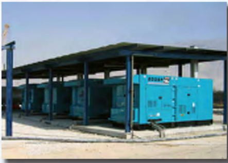
As the power source in the area where electricity is unavaible.