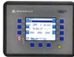
EASY GEN 3500

(4) Fully Automatic Parallel Operation Device "EASY GEN": High-speed digital control enables all operations from starting and stopping to synchronization verification, synchronization activation and load sharing to be performed at the touch of one button. This device has multiple functions that enable parallel operation of generators with differing capacities, the number of units being operated to be controlled and other operations.