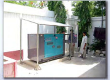
As the Emergency power source in the hospital.