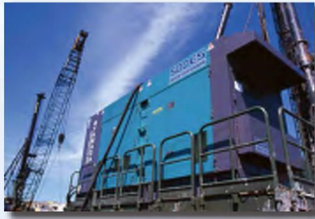
As the power source in the construction site.