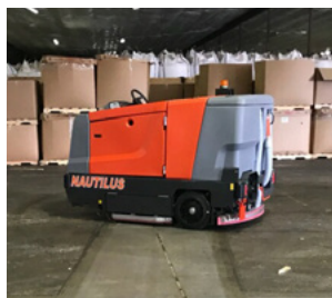
High Performance Industrial Cleaning Results