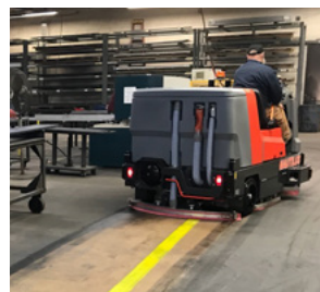
Clean and Safe Floors in a Single Pass