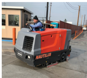
Versatile Outdoor Cleaning Applications