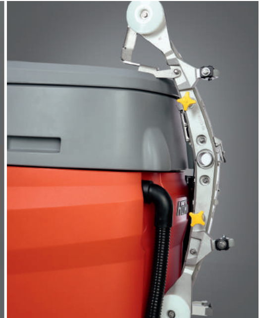
Clearance width 76 cm Ideal for checkout areas