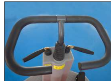
To facilitate effective and efficient cleaning operations, Brush controls are mounted on the steering column.