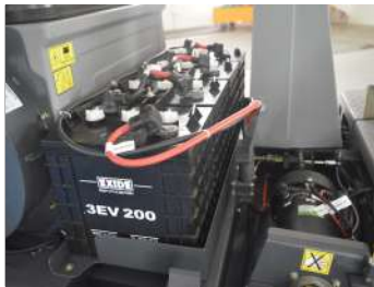
Four heavy duty deep cycle batteries provide extended run time and increased productivity.

RELIABILITY: Rugged, High quality build, robust construction and essential mechanics ensure reliability.