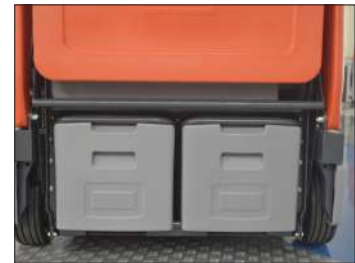
Easy to remove and dispose dual debris hoppers.