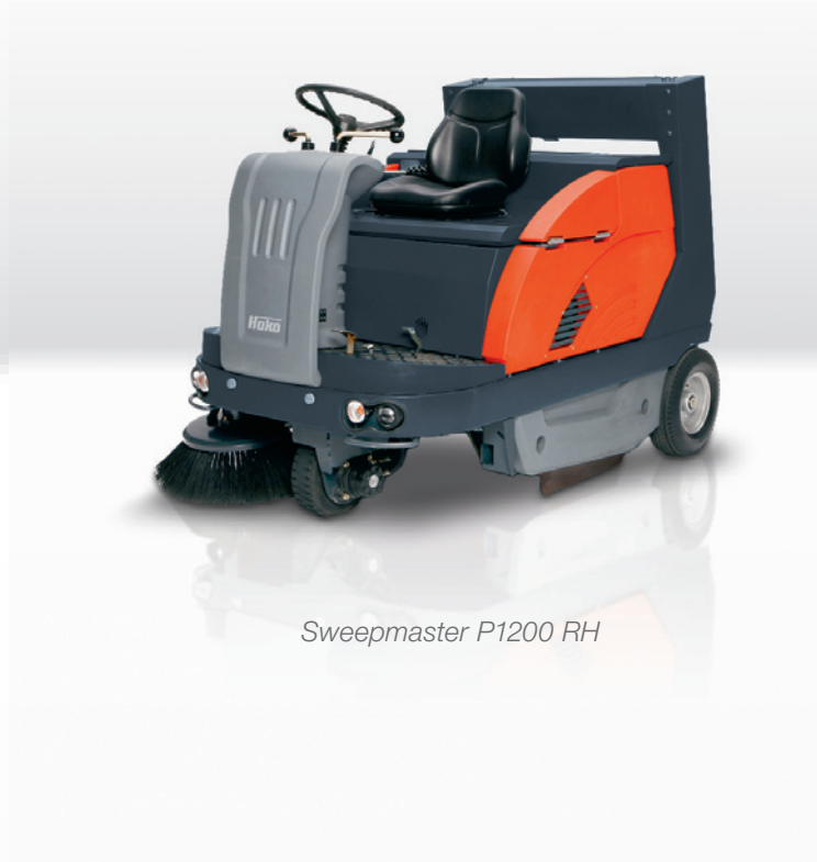
Sweepmaster P1200 RH