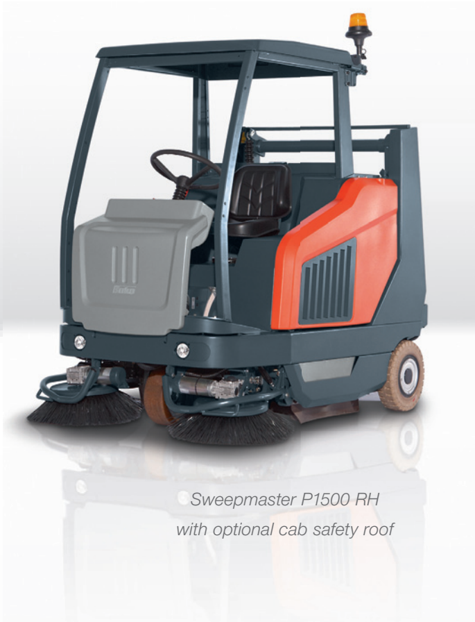
Sweepmaster P1500 RH with optional cab safety roof