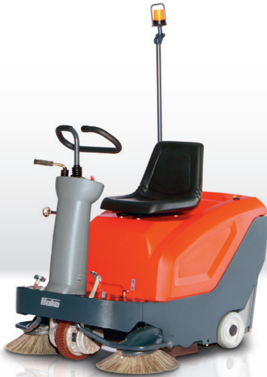
Sweepmaster B800 R