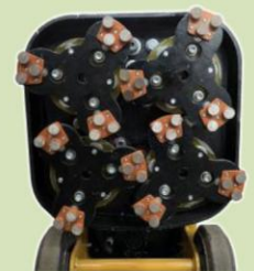
4 x Magnetic Pad Holder