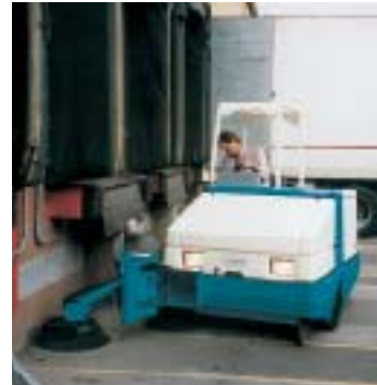
The Model 6550's optional SB2 auxiliary sidebrush cleans areas not accessible to regular sweepers.