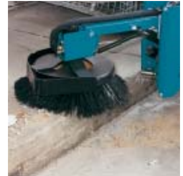
While the main brush sweeps debris on street level, the SB2 cleans up on the curb.