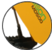
Hydraulic tipping bucket

Diesel Engine / Single cylinder / Air cooled / Electric start