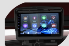
9" Bluetooth Touchscreen W/Back-up Camera