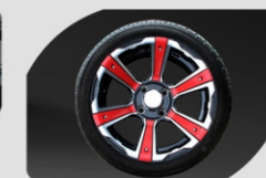
14" Color Matched Radial Tires