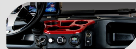
USB Socket+12V Power Outlet Color matched dashboard