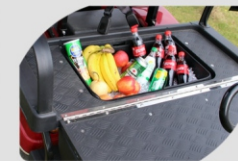
Folding Rear Seat Trunk & Holder